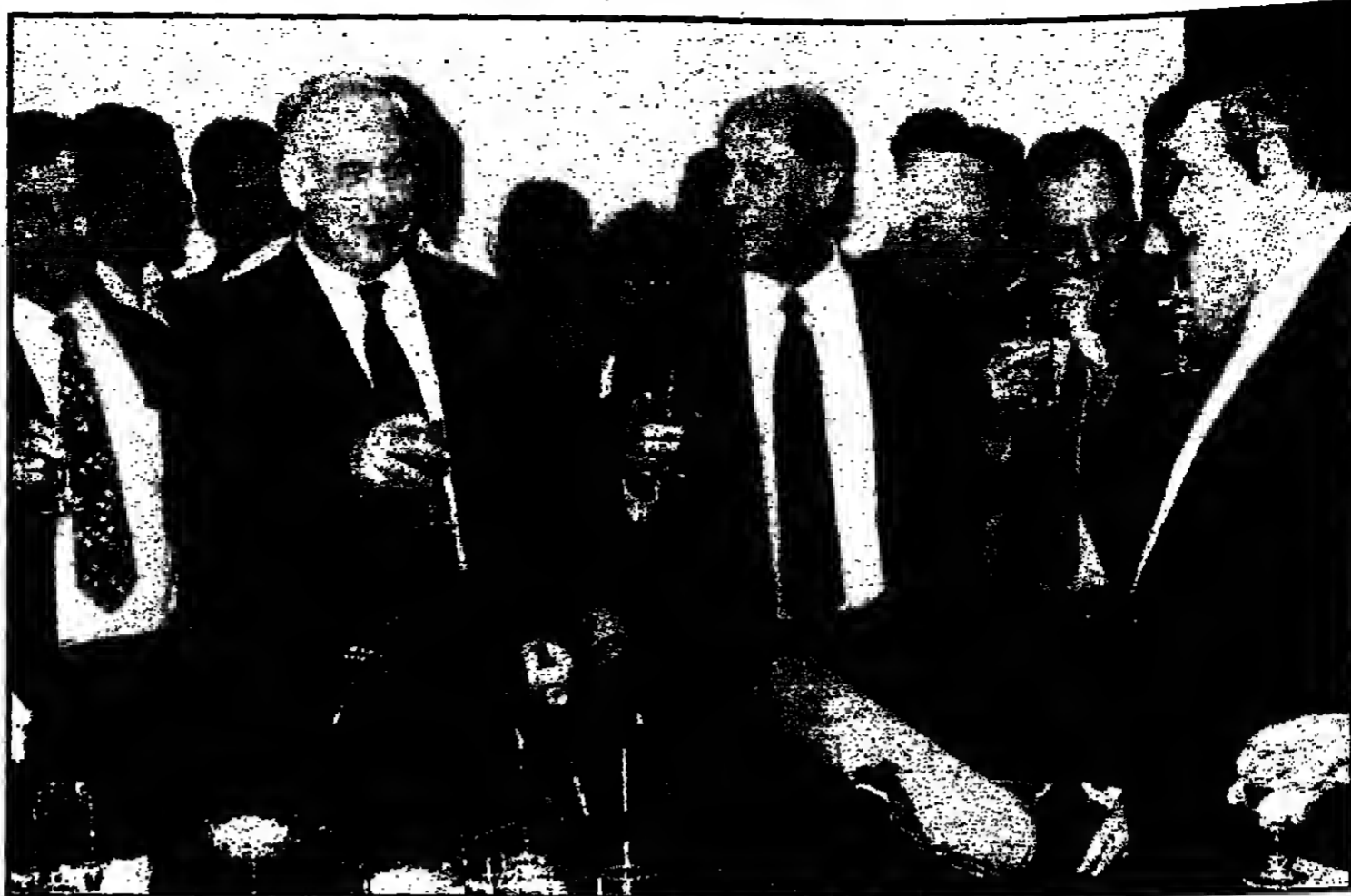
Prime Minister Binyamin Netanyahu and coalition chairman Michal Eitan (third from left) join coalition MKs in a toast celebrating the end of the Knesset's winter session yesterday.